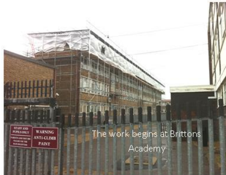
The work begins at Brittons Academy

The construction of our school buildings has changed over the years from strongly built brick to lighter weight structures which are now often very large. During this time the waterproofing membranes remained the same and the stresses placed upon them through the building movement and the addition of insulation, resulted in roof leaks and failures. Fortunately the roofing industry has responded and around the 1980's modern flexible waterproofing membranes started to arrive and the development of these have brought good reliability and performance. With the advent of rubber modified membranes with glass fibre and polyester bases, long term performance is assured and extended guarantees are now available. Matching materials and insulation to the building requirements is essential to achieving a long term solution to a roof renewal. With a properly installed flat roof with the right materials, the problems previously associated with flat roofs are fast becoming a thing of the past. Unfortunately the old cheap unsuitable materials are still available but should only be used on garden sheds. Poor workmanship through lack of training can still be a problem and so the choice of