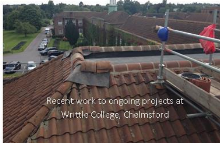
Recent work to ongoing projects at Writtle College, Chelmsford

contractor is very important. Mells Roofing has the experience needed and is well able to provide independent assistance. We are dedicated to providing a reliable high quality service through good workmanship and honest advice. We take responsibility for delivering all our work in a professional manner and to a high standard.