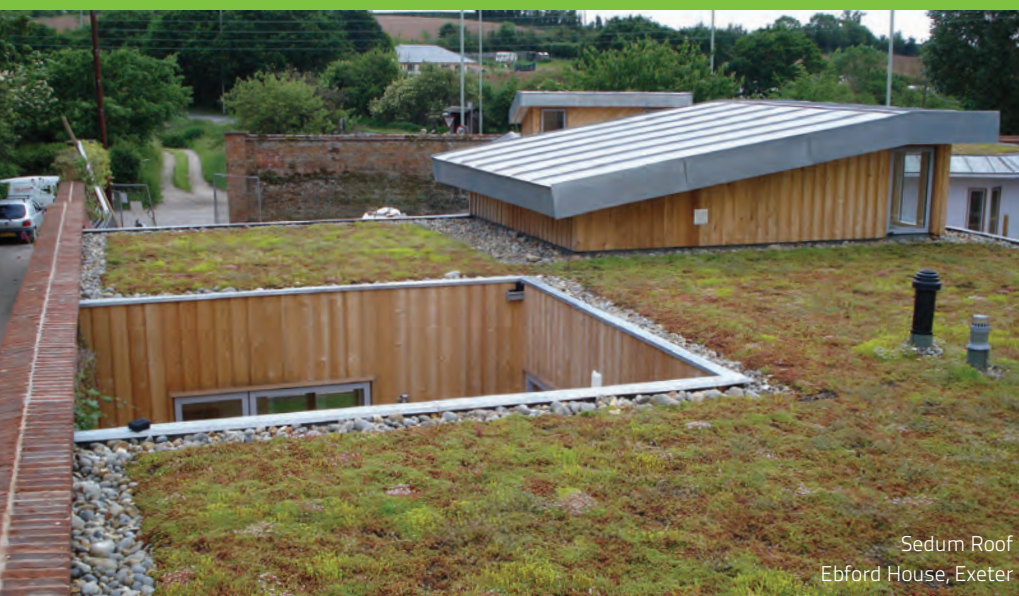
Sedum Roof Ebford House, Exeter