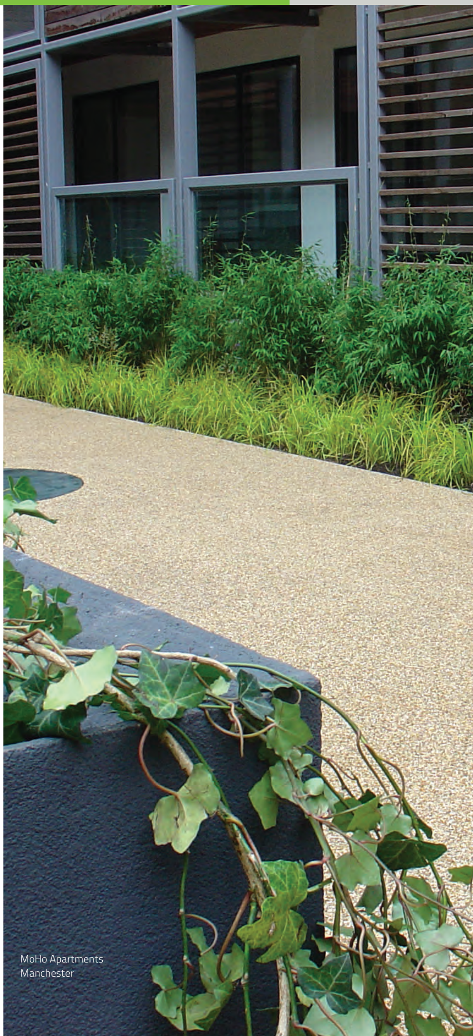
MoHo Apartments Manchester

This code has been developed in partnership with national and European experts, including The Green Roof Centre at the University of Sheffield, Livingroofs.org, GRO (Green Roof Organisation) members, the Environment Agency and Homes and Communities Agency.