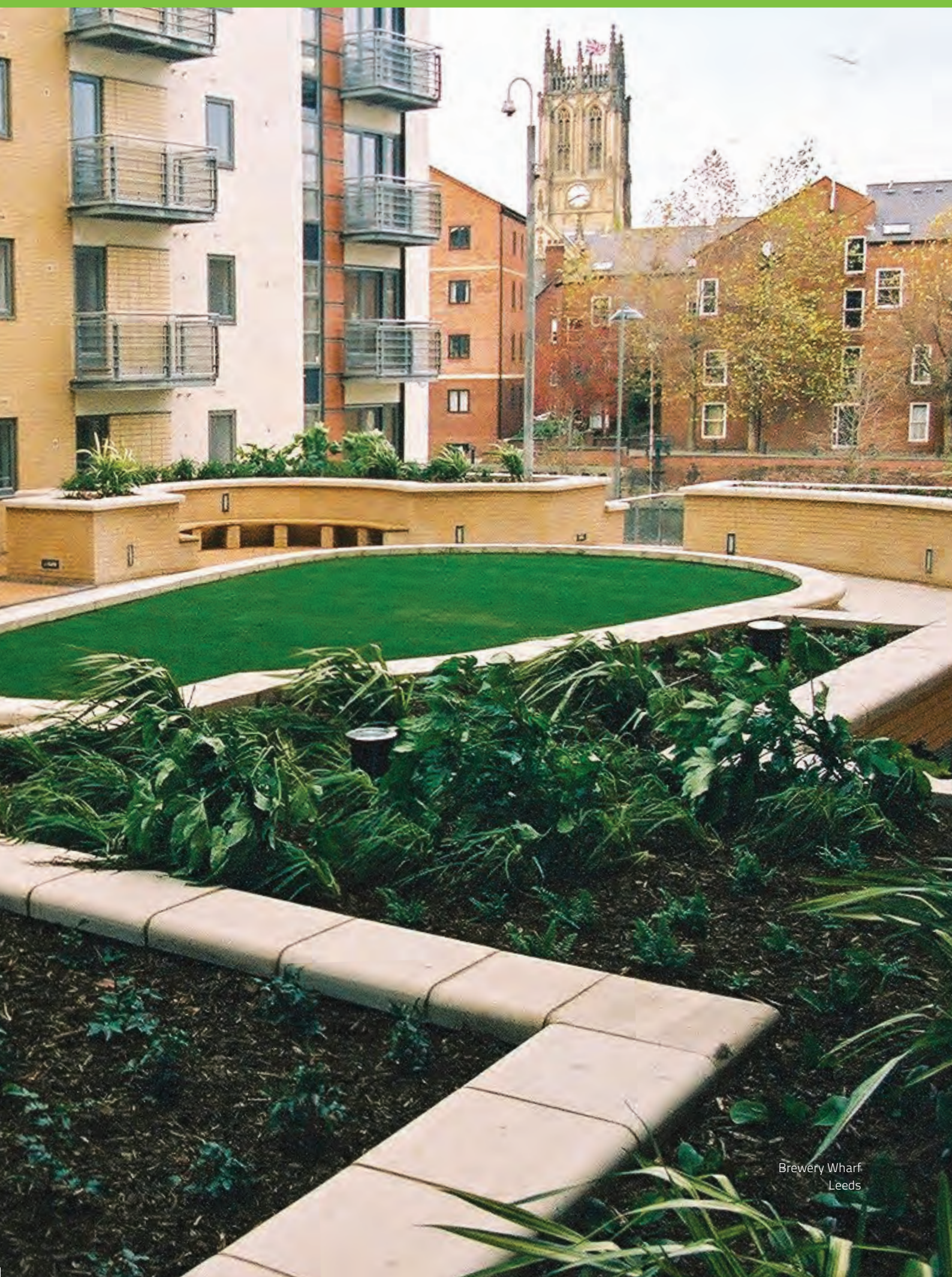
Brewery Wharf Leeds