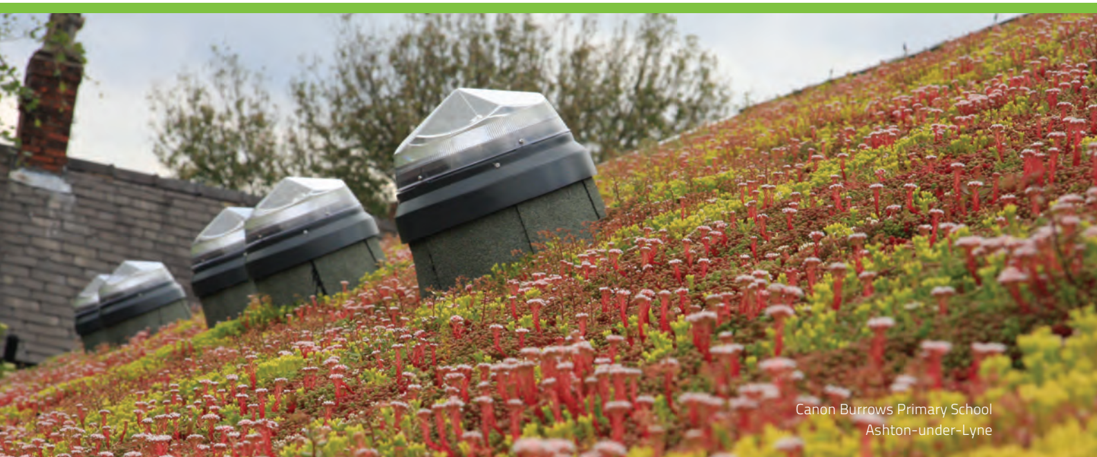
Canon Burrows Primary School Ashton-under-Lyne