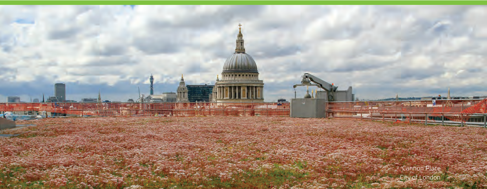
Cannon Place City of London